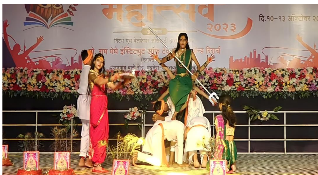
The students performance on Youth festival