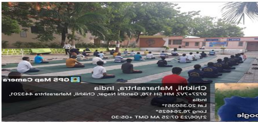
Participants Actively Participated in Yoga day