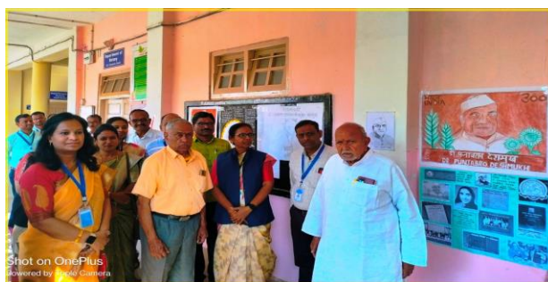
Posters were displayed on wall