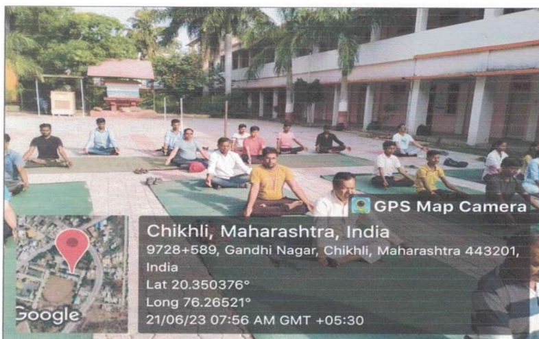
Participants Actively Participated in Yoga day