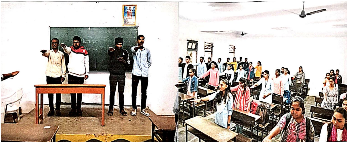
Preamble reding during the Constitution Day celebration

Updeshi Coordinator IQAC, Shri Shivaji Sci. & Arts College, Chikhli Dist. Buldana