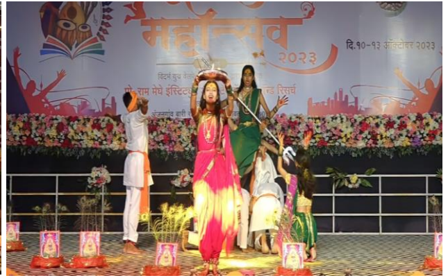
The students performance on Youth festival