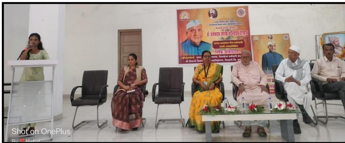
Student presenting her views