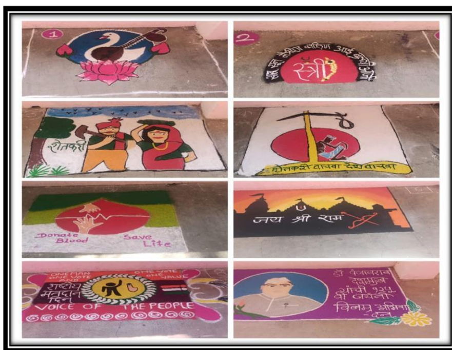
Rangoli Drawings by Students