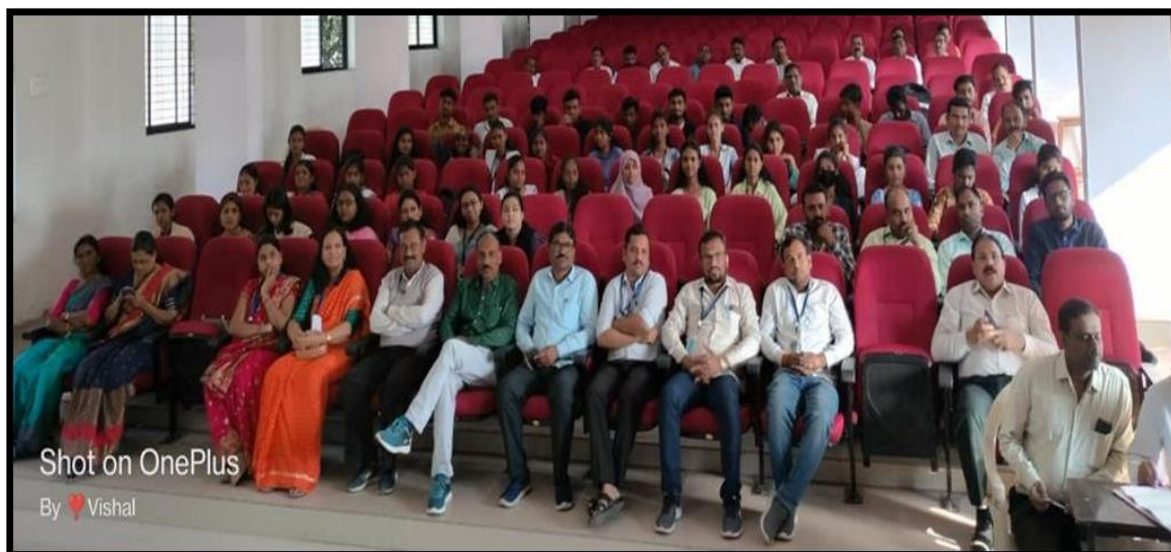
Students and Staff listening to the speakers of the Elocution Competition

Upashti Coordinator IQAC, Shri Shivaji Sci. & Arts College, Chikhli Dist. Buldana