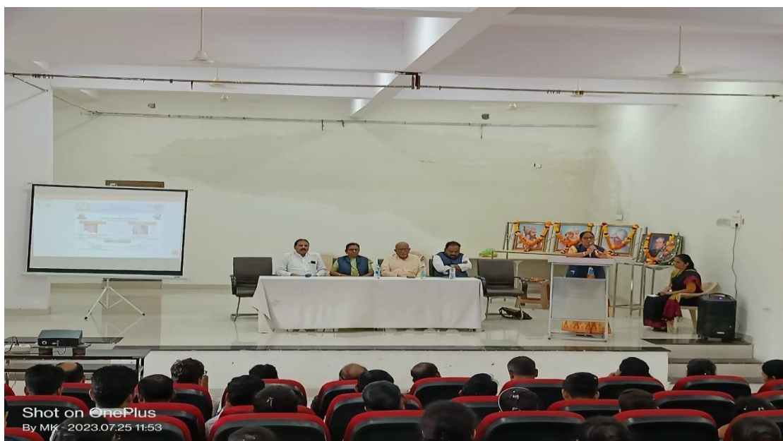
Inaugural Function of the Induction Programme

Upadhi Coordinator IQAC, Shri Shivaji Sci. & Arts College, Chikhli Dist. Buldana